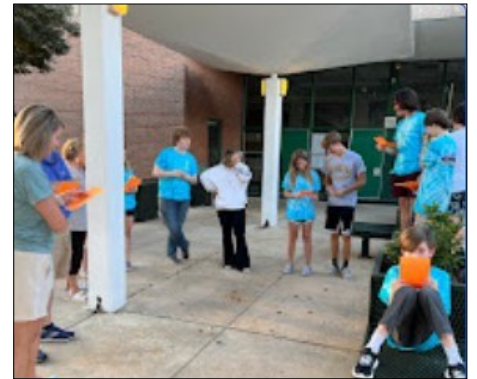
Northern Nash High School