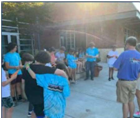
Rocky Mount Academy