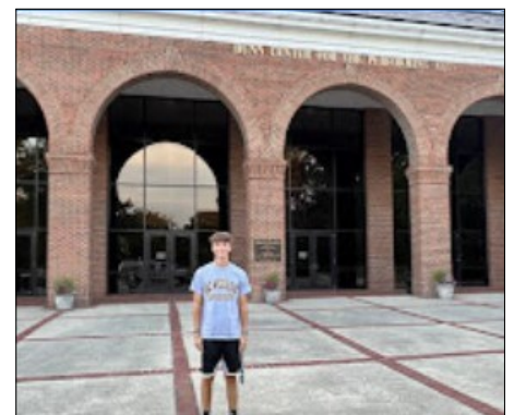
North Carolina Wesleyan University