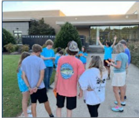
Nash-Rocky Mount Early College High School