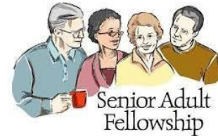
Senior Adult Fellowship

Members are reminded to bring paper products for the Lighthouse and food for Faith Christian Ministries. The UMW is open to all women of the church so anyone wishing to join us please come!!