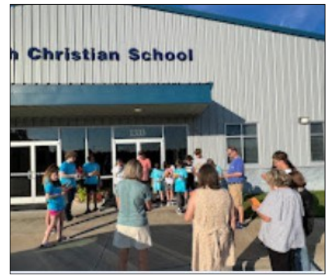
Faith Christian School