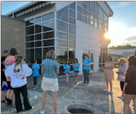
Nash Central High School