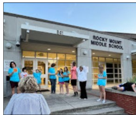
Rocky Mount Middle School