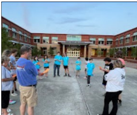
Rocky Mount High School