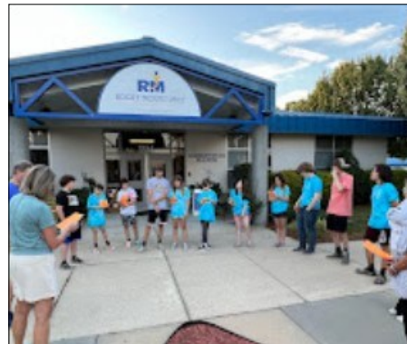
Rocky Mount Preparatory School