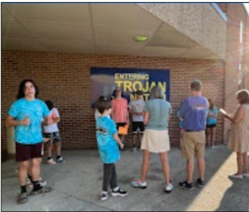
Nash Central Middle School

Our EUMC Youth are starting the year off right—with prayer! On Sunday, August 28 th our youth traveled to each of the ten schools where our students are attending this year to pray over them for the new school year. Prayers at Schools is a long held and much loved tradition for our youth group, and this year we were able to share it with our friends from the St. Andrew's Episcopal Church youth group as well!