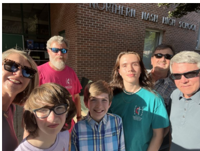
Northern Nash High School

over them for the new school year. Prayers at Schools is a long held and much loved tradition for our youth group, and this year was no exception. Please continue to join us in praying for all students, teachers, and school staff as they continue through this school year!