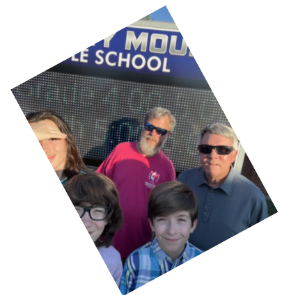
Rocky Mount Middle School