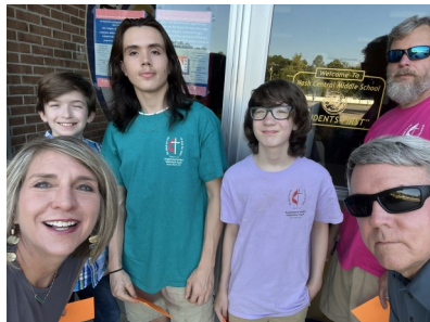
Nash Central Middle School