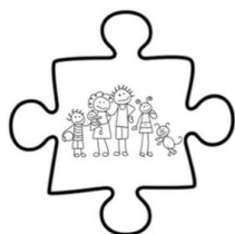
TC Family Autism Group EUMC

Autism Family Support Groups now meet at EUMC and La Hermosa Church in Bailey! Both groups are having great success in meeting the needs of our families with special programs that are requested by the families. Both groups offer a meal and childcare at no cost. Meals begin at 6:00 p.m. and end at 7:15 p.m.